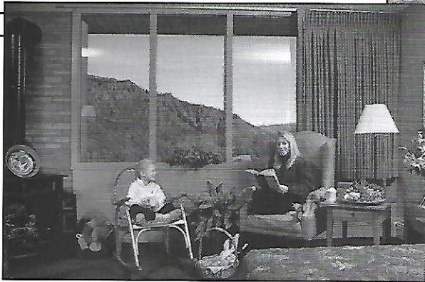
Hotels at $58 per night including breakfast

Combine your family vacation with the Colorado Suzuki Institute in the Rocky Mountains at Snowmass Village at Aspen! Luxury hotels, studios, and condominiums are available at affordable prices.