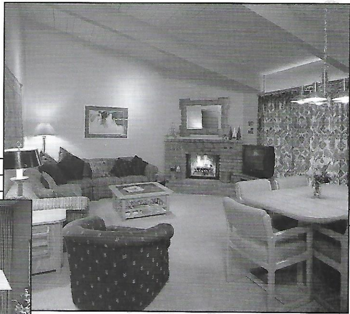
2 bedroom condominiums starting at $80 per night